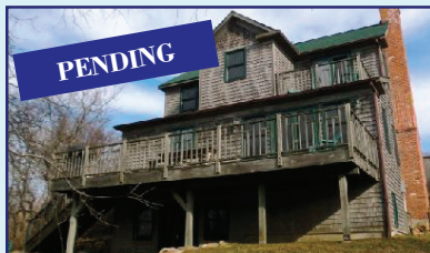
SOUTHWEST POINT: Pretty 4 bedroom, 3 bath, western views, stone fireplace. $995,000

"Let us show you the most beautiful properties on Block Island." — Nancy Pike and Mary Stover