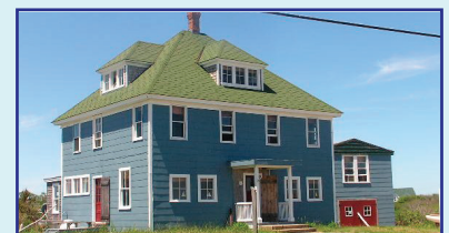
CORN NECK ROAD: 5 bed, 2 bath iconic summer home with 2 bedroom cottage. Mixed use. $1,850,000