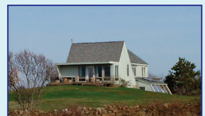
WEST SIDE ROAD: 3 bedroom, 1 bath cottage on private 2.5 acre lot with panoramic views. $1,370,000