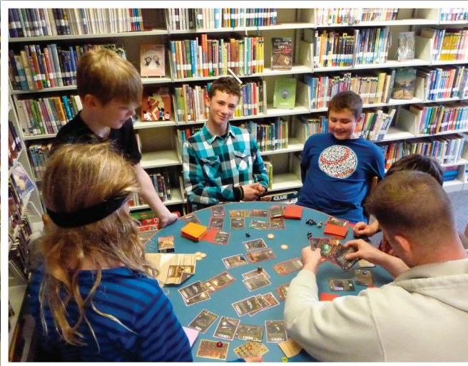
A group of young gamers test out "Hull Breach," a dice and card game developed in Providence, at the Island Free Library this past Sunday.