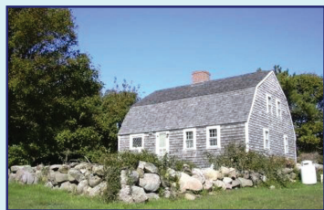
SMILIN' THROUGH: 3 bedroom main house w/guest cottage. $995,000