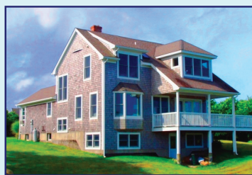
LAKESIDE FARMHOUSE: 4-bedroom, 2.5 bath privately located on 2.5+ acre lot abutting conserved land off Lakeside Dr. $1,675,000