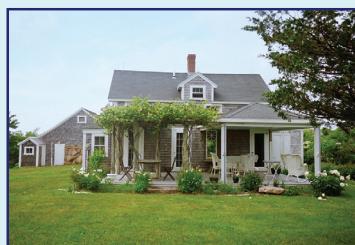
OFF CENTER ROAD: Historic home and guest quarters. 4 bedrooms, 3 baths abutting preserved land for privacy. $1,600,000