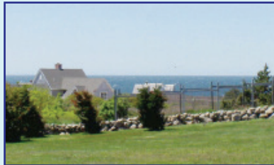
SOUTHWEST POINT: 2 acre desirable lot. Sunset ocean views, 5 bedroom engineering, approved $877,800