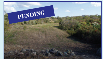
WEST SIDE ROAD: Generous building envelope on lovely 2.5 acre lot. $695,000